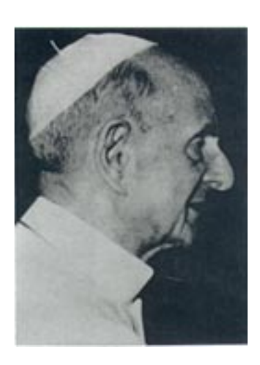
The Impostor: Nose is shorter and more round - reaching only 3/4 length of ear. Ear is longer and not as wide.